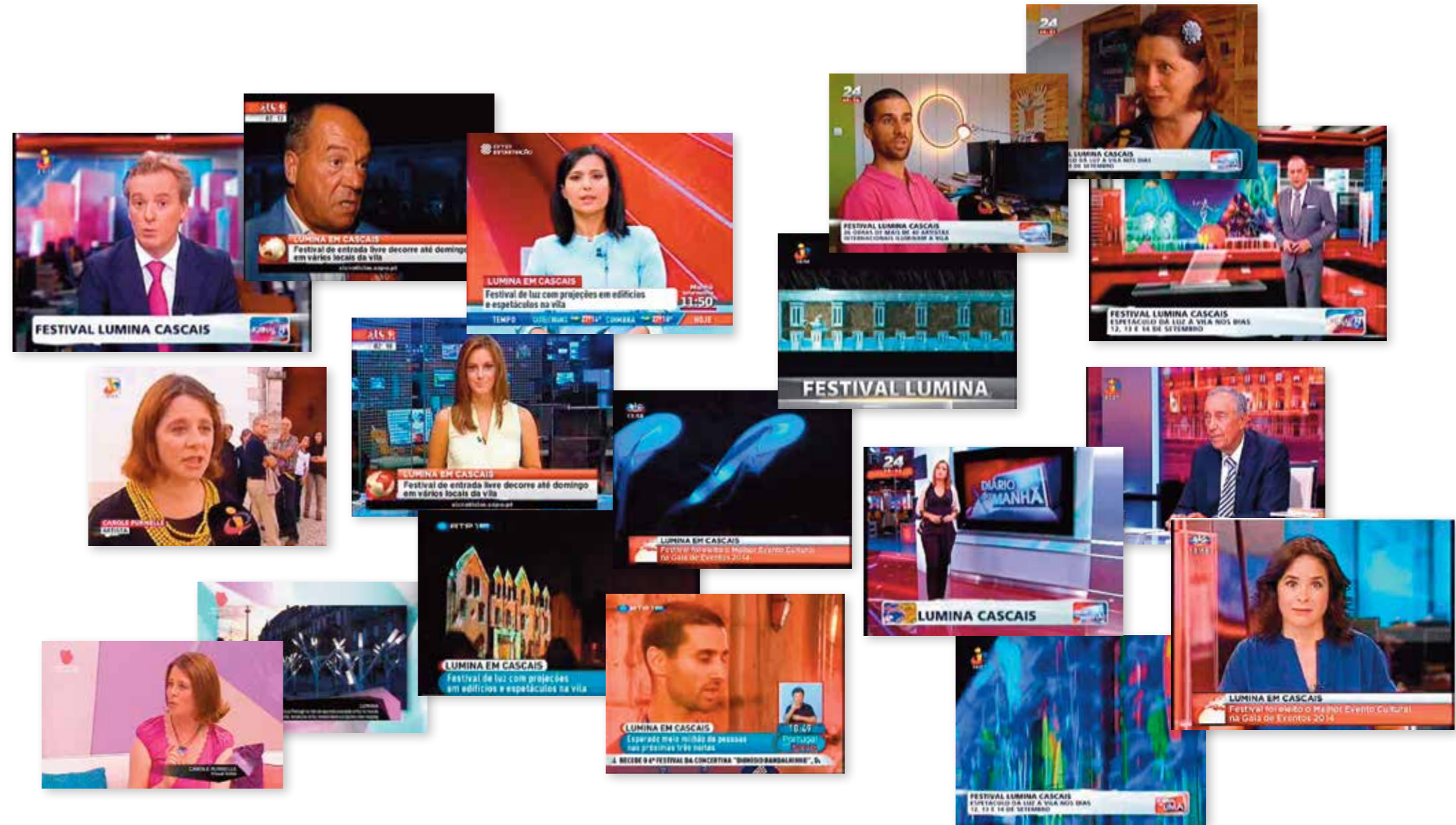
LUMINA FESTIVAL DA LUZ 2014