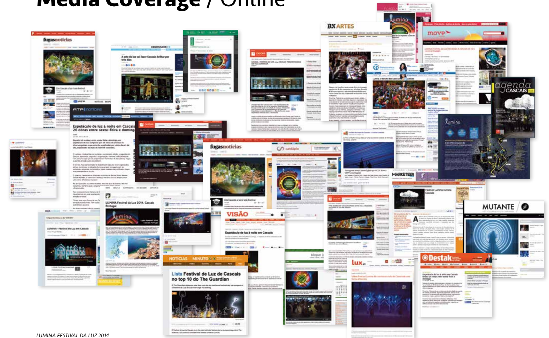
LUMINA FESTIVAL DA LUZ 2014